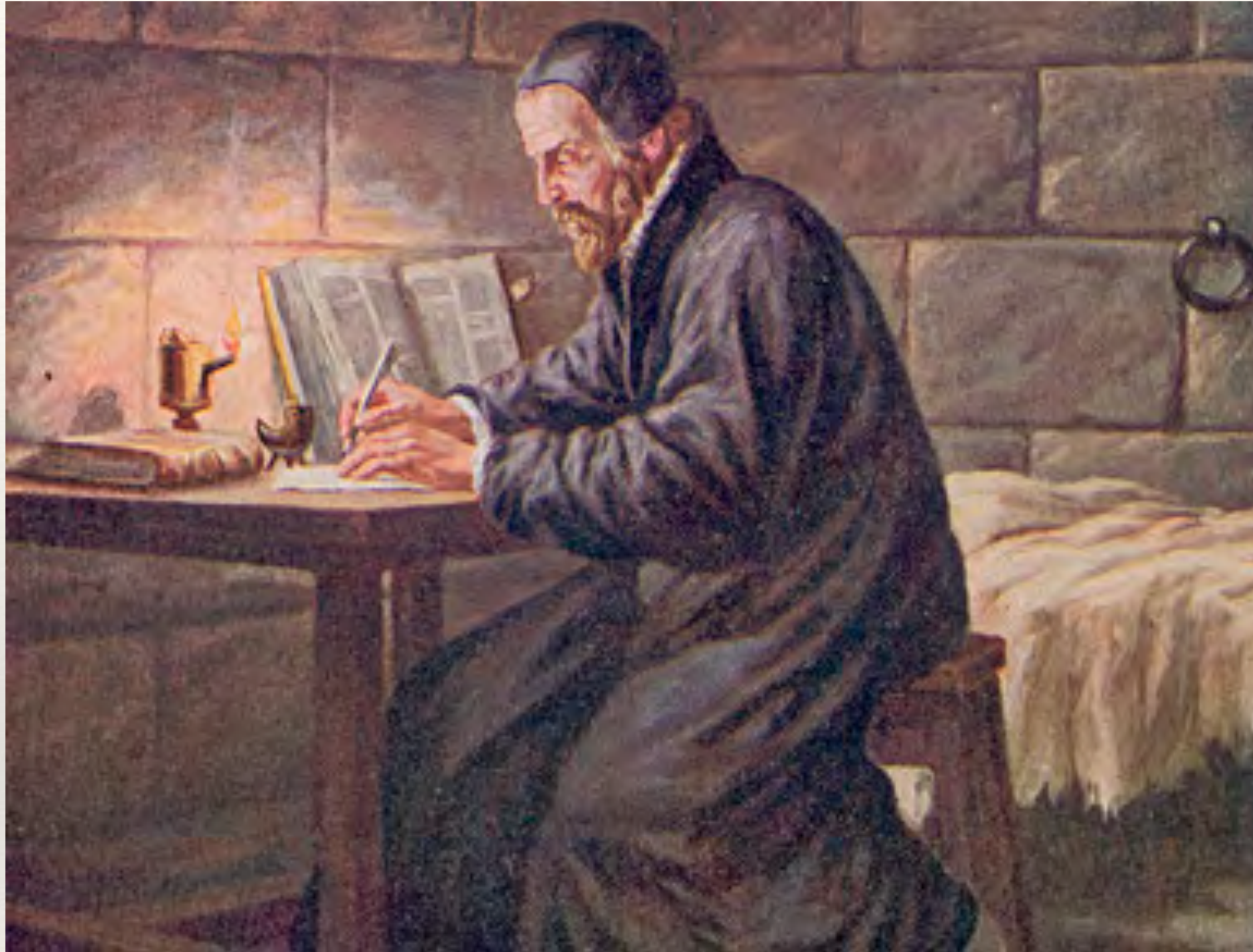
William Tyndale 1494 - 1536